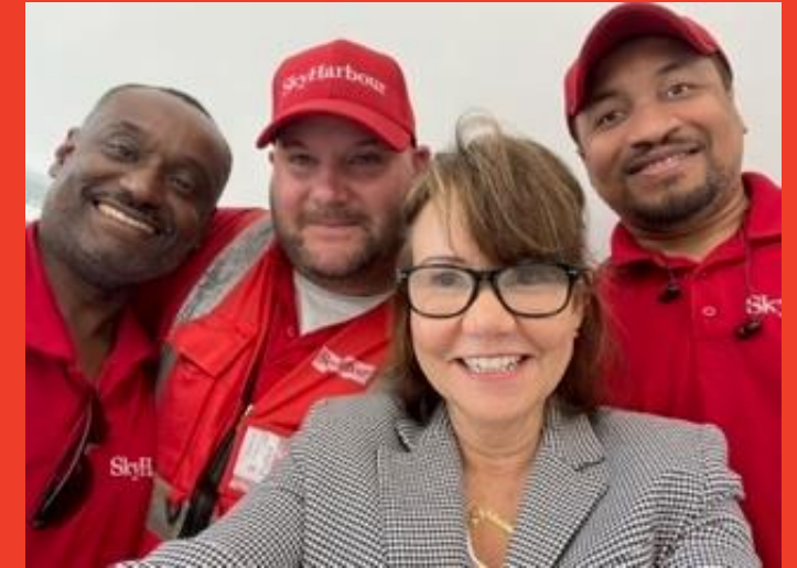
Ground Operator Training at SGR airport

~300 trained individuals ready for a career in aviation industry